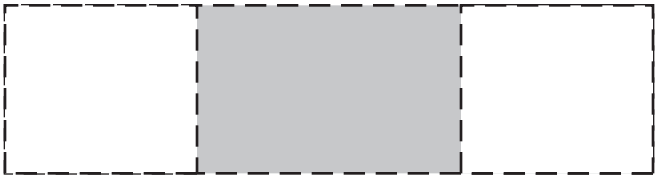
2-Sided Wrap SCREEN

Artwork may appear to be off center due to production needing 1.5 inches spacing away from the handle