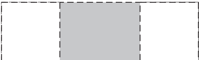
2-Sided Wrap LASER ENGRAVE