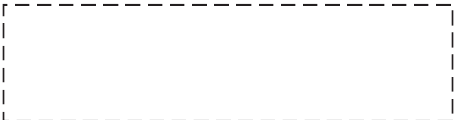
6-3/4" x 1-3/4" Wrap SCREEN