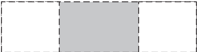
2-Sided Wrap DIGITAL